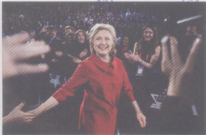
Clinton at the AIPAC conference in Washington, in March