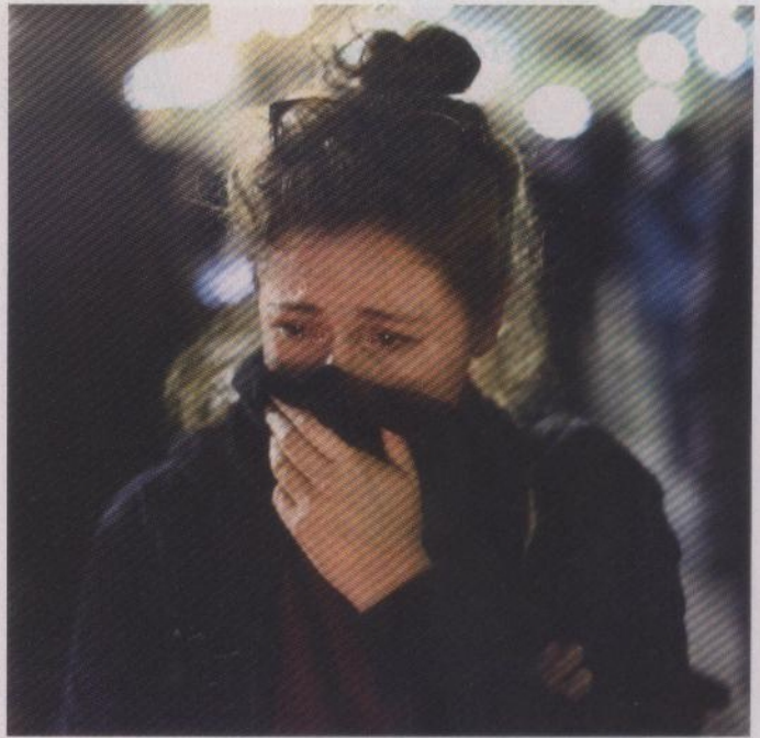
A mourner at the Place de la République in Paris on Nov. 14