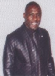
Idris Elba stars in Beasts

52 | 10 Questions with Turkish novelist Orhan Pamuk