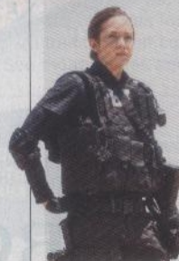
Blunt in Sicario

56 | 7 Questions with filmmaker Nancy Meyers