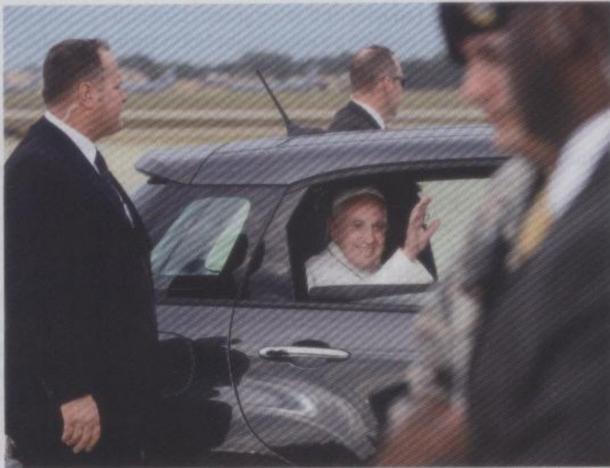
Pope Francis at Joint Base Andrews in Maryland on Sept. 22