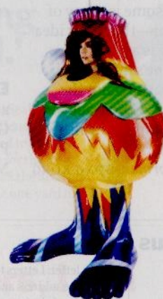
Björk's album art

ON THE COVER: George H.W. Bush, Jeb and George W. in 1970.