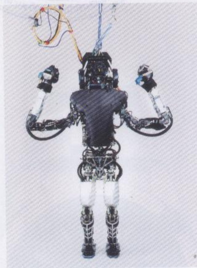
A robot designed in the shape of a human at the Florida Institute for Human and Machine Cognition in Pensacola, Fla.