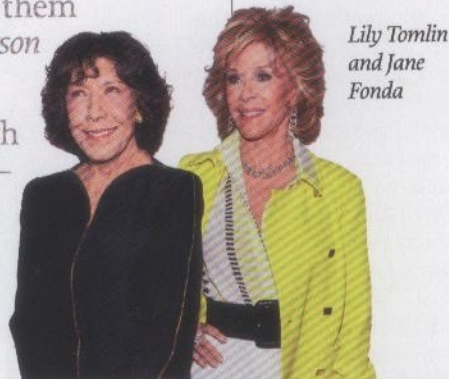
Lily Tomlin and Jane Fonda