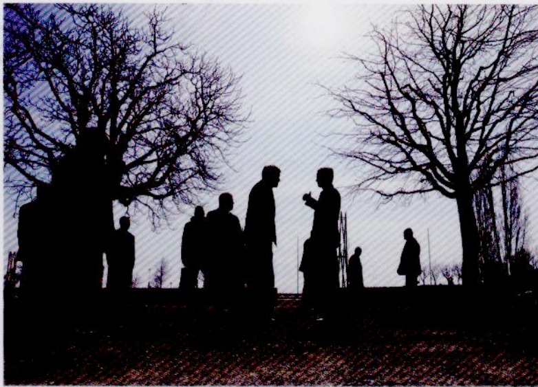
During a break in talks with Iran's Foreign Minister, John Kerry chats with an aide outside a hotel in Lausanne, Switzerland, on March 17.