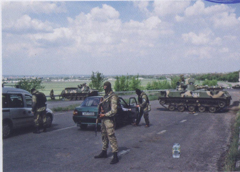
Ukrainian forces stop cars at a checkpoint on the road to Slavyansk, in the eastern part of the country, on May 4.