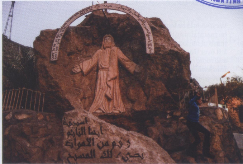
A Coptic girl plays next to a stone carving of Jesus at St. Samaan Monastery in Cairo.