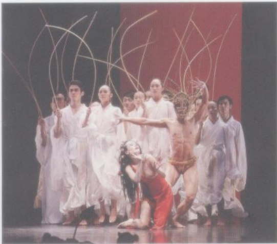
Central News Agency