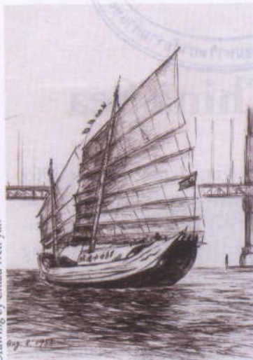
Drawing by Chiau Wen-yan